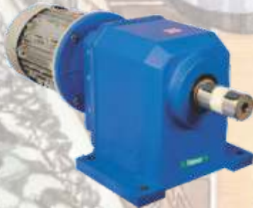
Helical Inline Geared Motor