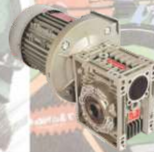
Worm Geared Motor