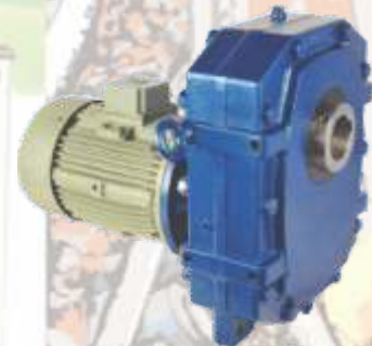
Parallel Helical Geared Motor