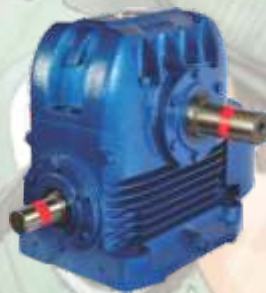
Worm Gear Box